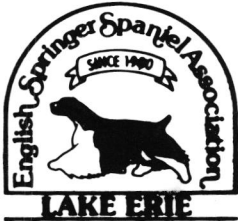
LAKE ERIE ENGLISH SPRINGER SPANIEL ASSOCIATION, INC.