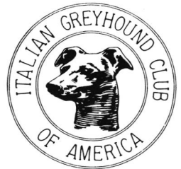
ITALIAN GREYHOUND CLUB OF AMERICA