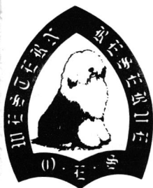
WESTERN RESERVE OLD ENGLISH SHEEPDOG CLUB, INC.