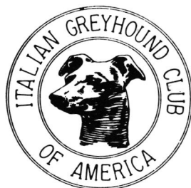
ITALIAN GREYHOUND CLUB OF AMERICA